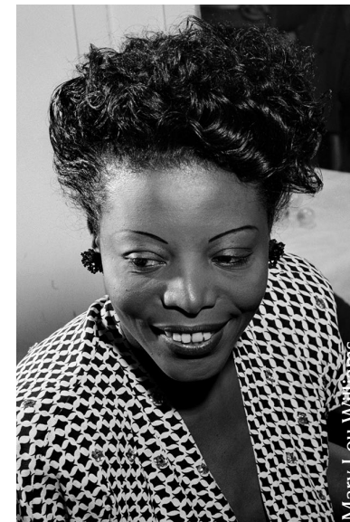
Mary Lou Williams

Let's talk about the composers and their music, and what led you to include them in Resilience.