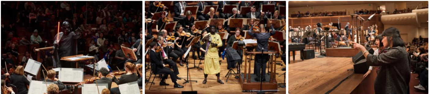
(High resolution images from past Music for Families performances are available for download from the San Francisco Symphony's Online Press Kit )

FOR IMMEDIATE RELEASE / FEBRUARY 4, 2022