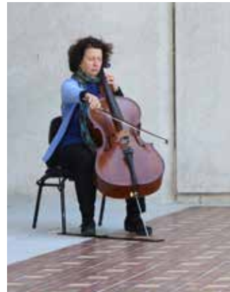
SF SYMPHONY CELLIST BARBARA BOGATIN, 1:1 CONCERT