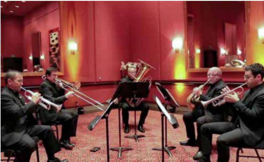
MUSIC DIRECTOR'S EVENING WITH SF SYMPHONY MUSICIANS

Music Director's Evening featured Music Director Esa-Pekka Salonen and San Francisco Symphony leadership, a cameo by Collaborative Partner Pekka Kuusisto, and a special brass quintet performance streamed live from the Wattis Room at Davies Symphony Hall.