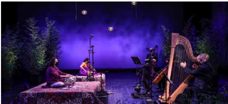
CURRENTS: RHYTHM SPIRITS, CURATED BY ZAKIR HUSSAIN