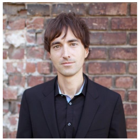
(High resolution images available for download from the SFS Media's Online Press Kit)